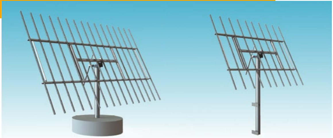
For open land